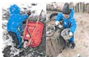
Mittens That Support Proper Grasp

Stay dry all day, in very wet conditions. The waterproof fabric is excellent for very wet surroundings, active play and outdoor life in heavy rain or wet snow. This style is also good for warmer days and climates and keeps shirts dry and clean.