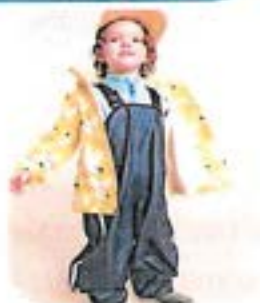
Tuffo Muddy Buddy

Clothing that allows children to go outside in all types of weather is imperative and directly related to the amount of time spent outside. This also helps with conversations with parents about outdoor play and helps alleviate the mess and cuts down on laundry for families. It makes outdoor play accessible and equitable for all children and we are seeing more and more child-care centres and facilities providing outdoor gear for the children in their